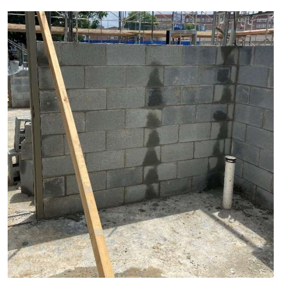
Mechanical Room 8" CMU