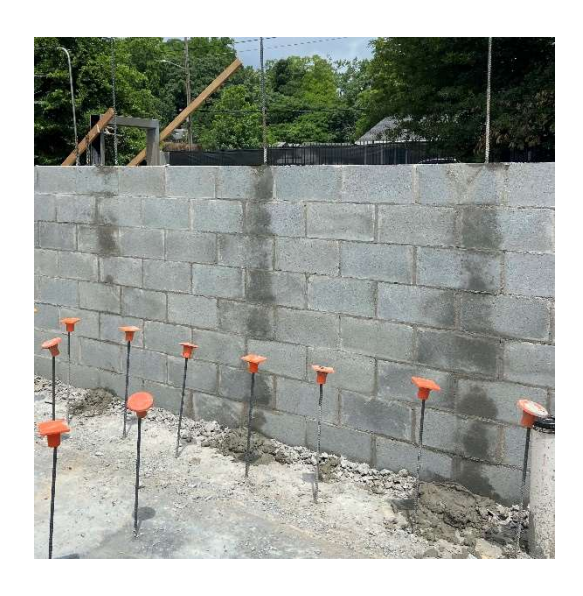
Interior 6" Chase Wall