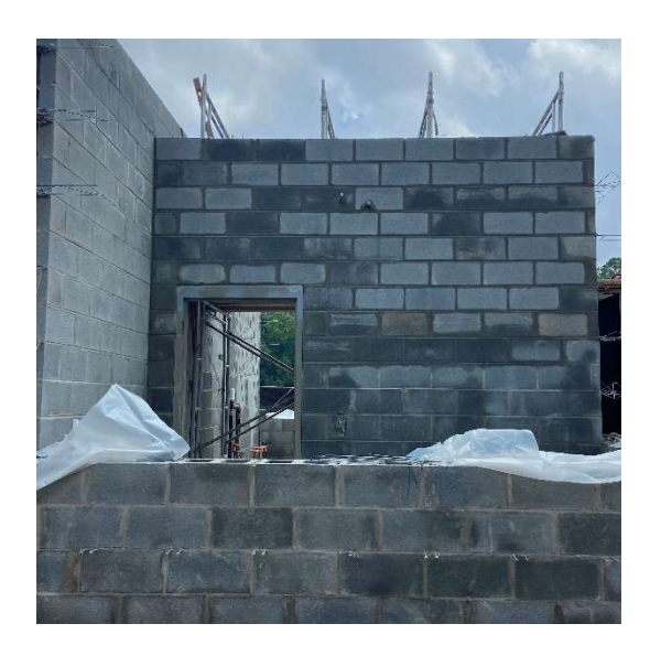
Storage Room 8" CMU